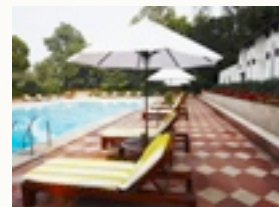
United Vet Photo

The Disabled American Veterans Van Program: The purpose of the program is to transport veterans with scheduled medical appointments to the nearest VA facility which is located in St. Petersburg. All drivers are volunteers. When a vehicle needs to be replaced, it is up to the local veteran's community to obtain the necessary funds. This program does not receive any government support. Their need is a new seven passenger Van.