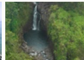
Cardiac Care Photo